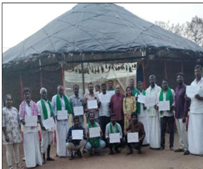
Training program on Agroecology, demonstration of BRC at DDS-KVK