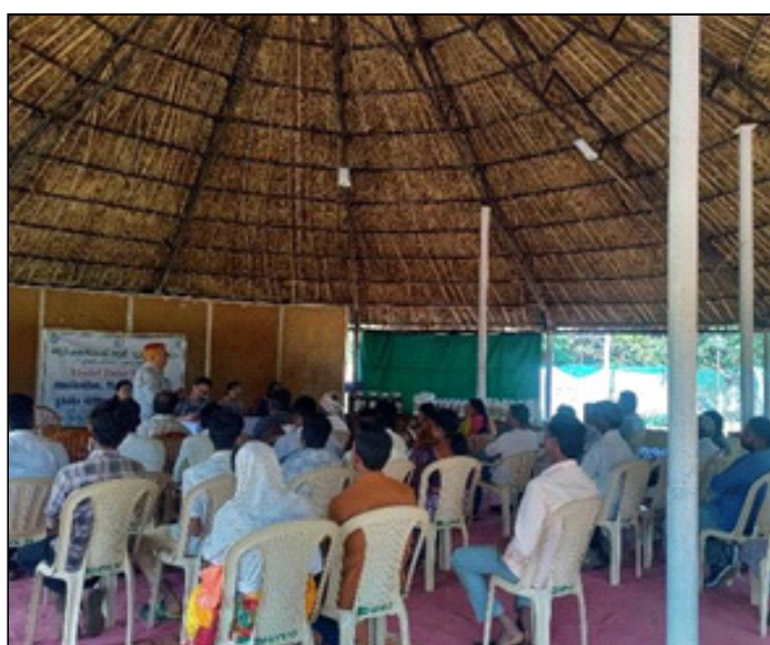
Bio-inputs distribution for farmers at DDS-KVK