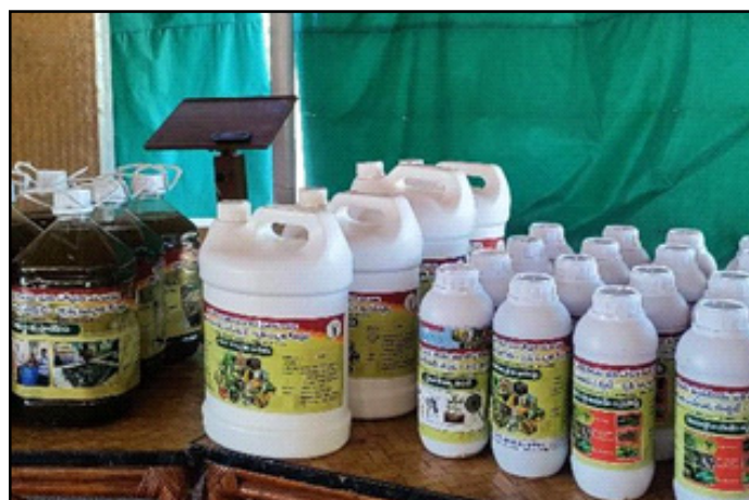
Bio-Resource Centre (BRC) established at DDS-KVK, Bio-inputs produced